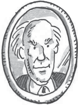
Lourens van der Post

In search of good leadership and facilitation